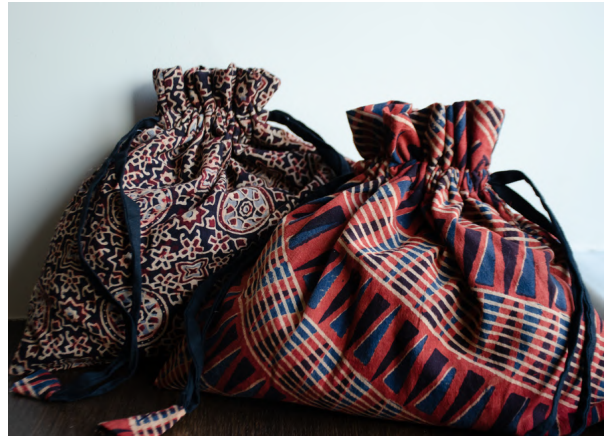
DIFFERENT TYPE OF HAND BAGS