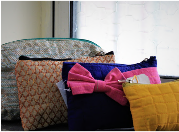
BOTUYA SIZE- 10" x 11.5"