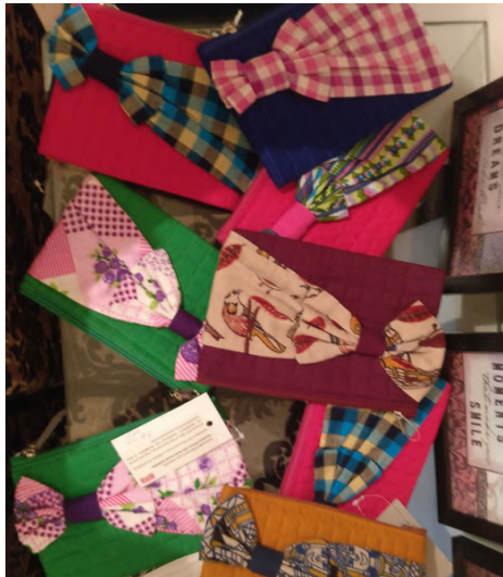
BOW COIN BAG SIZE- 4.5" x 7"