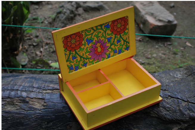
RECTANGULAR BOX SIZE- 5.2" x 7.5" x 2"