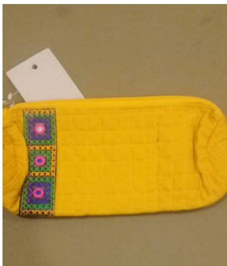
PENCIL POUCH SIZE - 9" x 4.5"