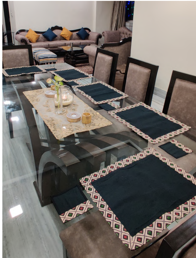
TABLE MAT (6PCS) SIZE- MAT- 12.5" x 10" COASTER- 5" x 5"

TO PLACE AN ORDER, PLEASE CONTACT : Chaiti Chakraborty at 7044033548 or chaiti@isankalpa.org We take custom orders based on your requirements