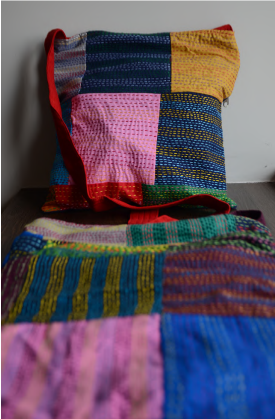
KATHA SLING BAG SIZE- 12" x 12" x 51"