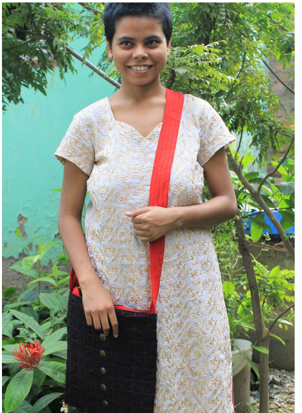
QUILTING SLING BAG SIZE- 12.5" x 11" x 50"

TO PLACE AN ORDER, PLEASE CONTACT : Chaiti Chakraborty at 7044033548 or chaiti@isankalpa.org We take custom orders based on your requirements