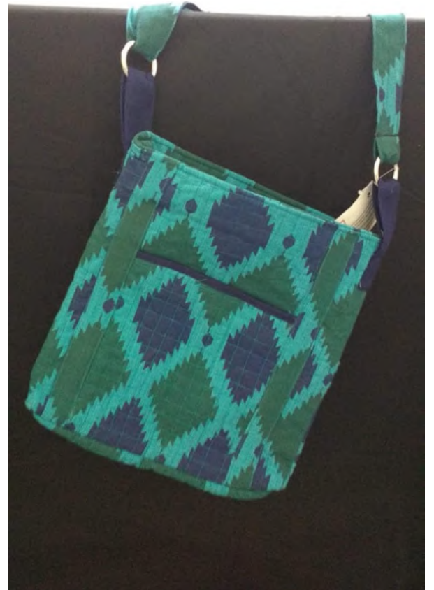
AMRAPALI BAG (HANDLE IS ADJUSTABLE) SIZE- 12" x 11"

TO PLACE AN ORDER, PLEASE CONTACT : Chaiti Chakraborty at 7044033548 or chaiti@isankalpa.org We take custom orders based on your requirements