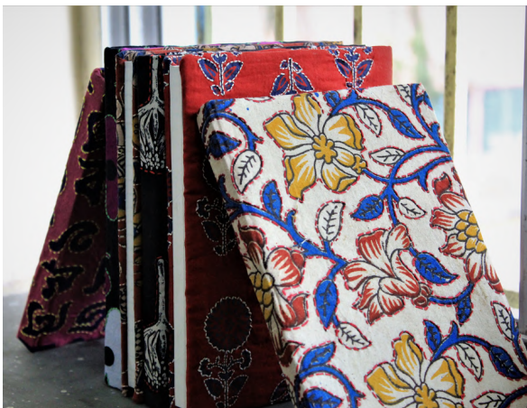
DIARY (100 PAGES) SIZE- 8" x 6"