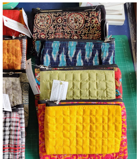
DOUBLE COIN BAG SIZE- 5" x 7.5"

TO PLACE AN ORDER, PLEASE CONTACT : Chaiti Chakraborty at 7044033548 or chaiti@isankalpa.org We take custom orders based on your requirements