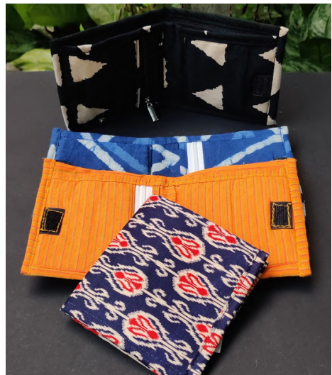
WALLET SIZE- 18.5" x 16"