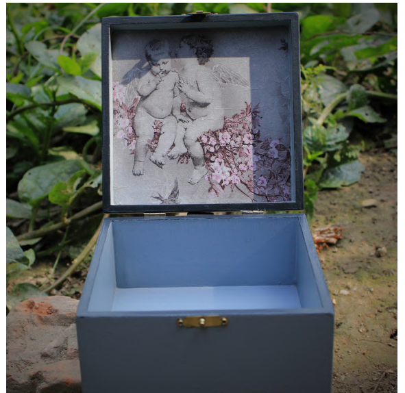
SQUARE BOX SIZE- 6" x 6" x 3"

TO PLACE AN ORDER, PLEASE CONTACT : Chaiti Chakraborty at 7044033548 or chaiti@isankalpa.org We take custom orders based on your requirements