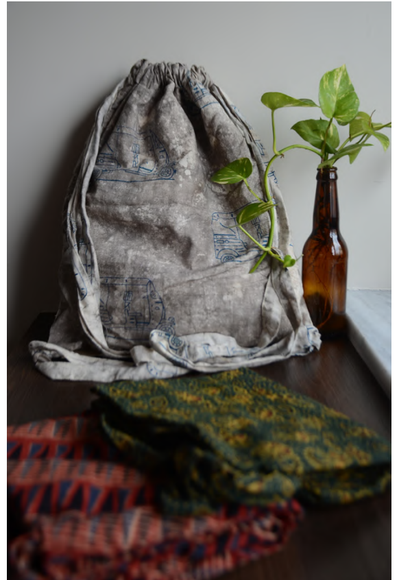
SHOULDER BAG SIZE- 18.5" x 16"

TO PLACE AN ORDER, PLEASE CONTACT : Chaiti Chakraborty at 7044033548 or chaiti@isankalpa.org We take custom orders based on your requirements