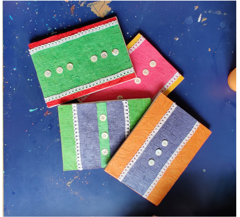
NOTEBOOK (50 PAGES) SIZE- 7" x 5"