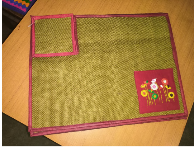
Table Mats with Coaster Set